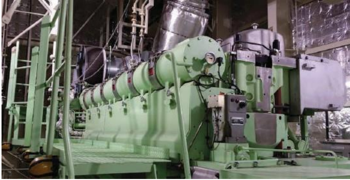
MJS NBR + strip insert 335mm, etc. medium speed propulsion engines & marine genset. Korea