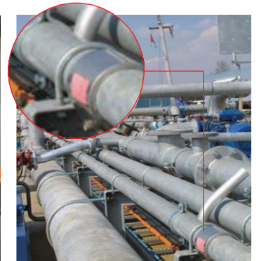
MJG EPDM 100A. sprinkler line for deck wash. Netherlands