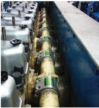
MJG EPDM 100A. engine room. Australia