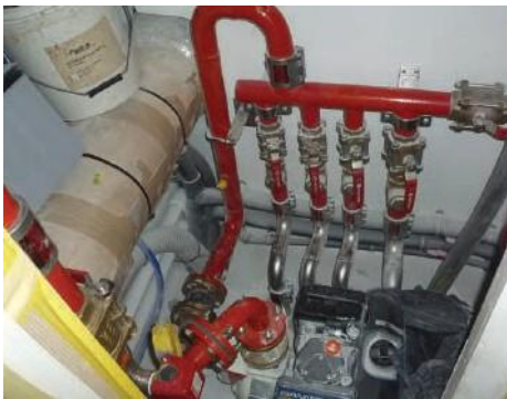
MJG NBR 40A. Taiwan