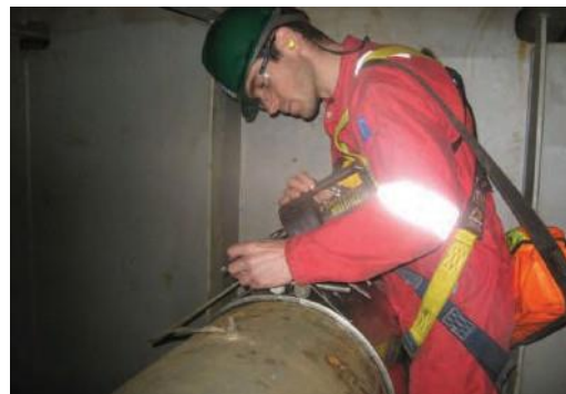
MJDL 400A. ballast system. Netherlands