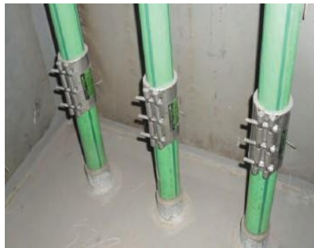
MJGL EPDM 40A. water supply line. PPR pipe. Korea