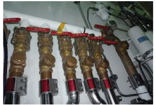
MJG NBR 40A. engine room. Taiwan