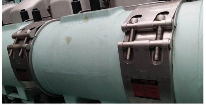
MJS NBR + strip insert 335mm, etc. medium speed propulsion engines & marine genset. Korea