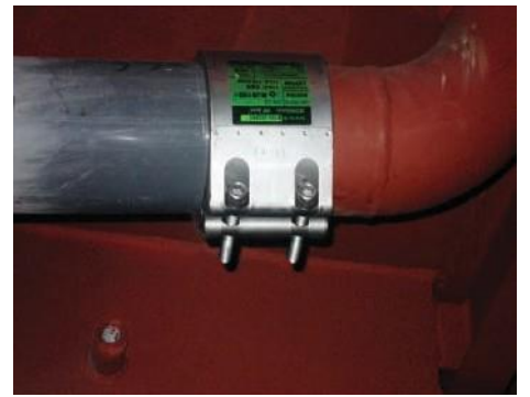
MJS EPDM 100A. PVC pipe + steel pipe. Korea