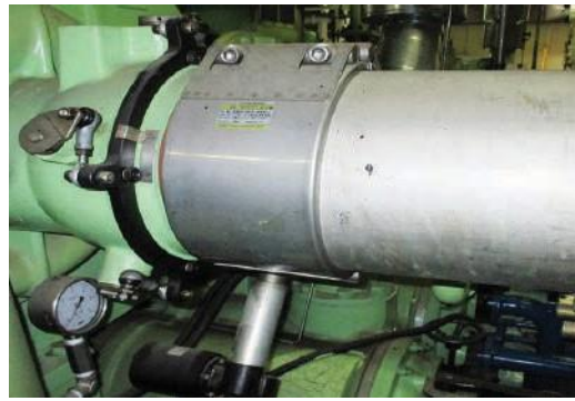
MJH EPDM 250A.